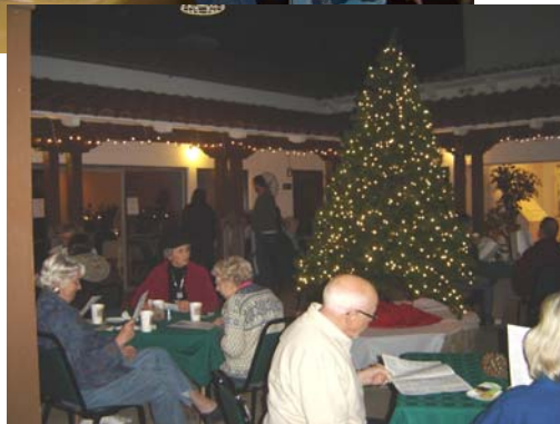
Right Picture: Christmas in the Courtyard—Dec. 6